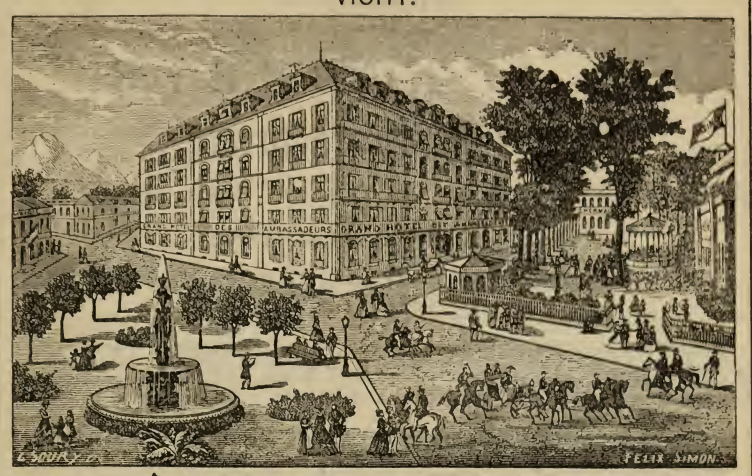
GRAND HÔTEL DES AMBASSADEURS, Situated in the Park.— This magnificent Hotel is now the first in the town. It is managed in the same style as the largest and best hotels on the Continent. By its exceptional situation, the house presents three fronts, from which the most beautiful views are to be had; and from its balconies is heard twice a day the excellent Band of the Casino. The management of its large and small spartments is very comfortable. Every room has a Dressing Room. Special wire going from all spartments to the private servants' rooms. Beautiful Reading, Drawing, and Smoking Rooms. Billiard Tables. English spoken. Omnibus of the Hotel at all Trains. The Hotel is open from the 18th of April. Post and Telegraph Offices adjoining the Hotel. ROUBEAU, Proprietor.