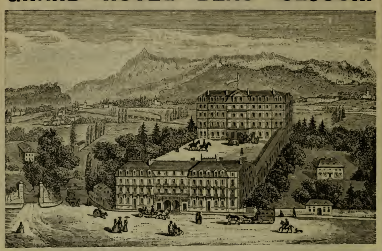
FIRST CLASS. Recommended for its Comfort. Incomparable position for beauty of the Panorama. Apartments for Families, with view embracing the Pyrénées. BOURDETTE, Proprietor. Pyrénées.